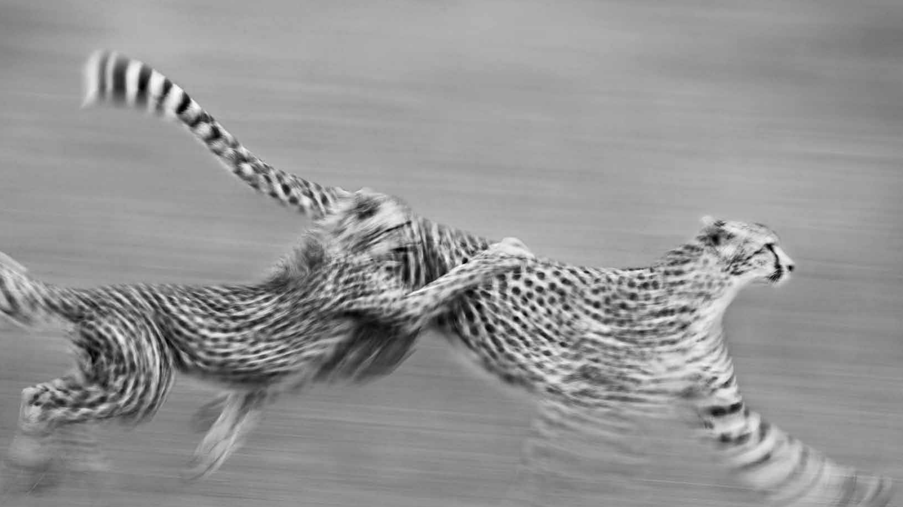
BUILT FOR SPEED A mother cheetah and her cub play at the Mara Conservancy. By blurring motion, Gulden captured the speed of the big cat, which runs faster than any land animal.