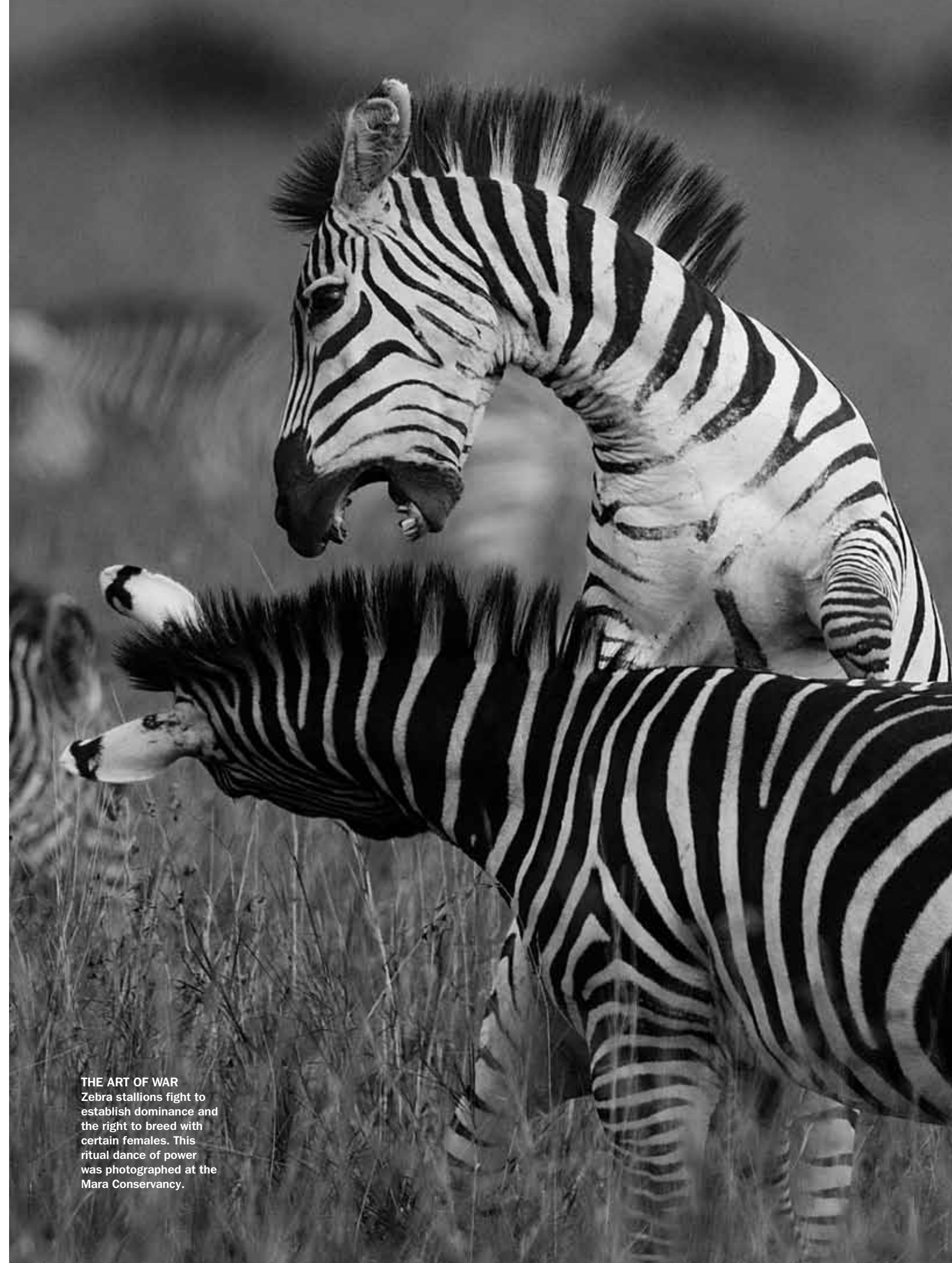
THE ART OF WAR Zebra stallions fight to establish dominance and the right to breed with certain females. This ritual dance of power was photographed at the Mara Conservancy.