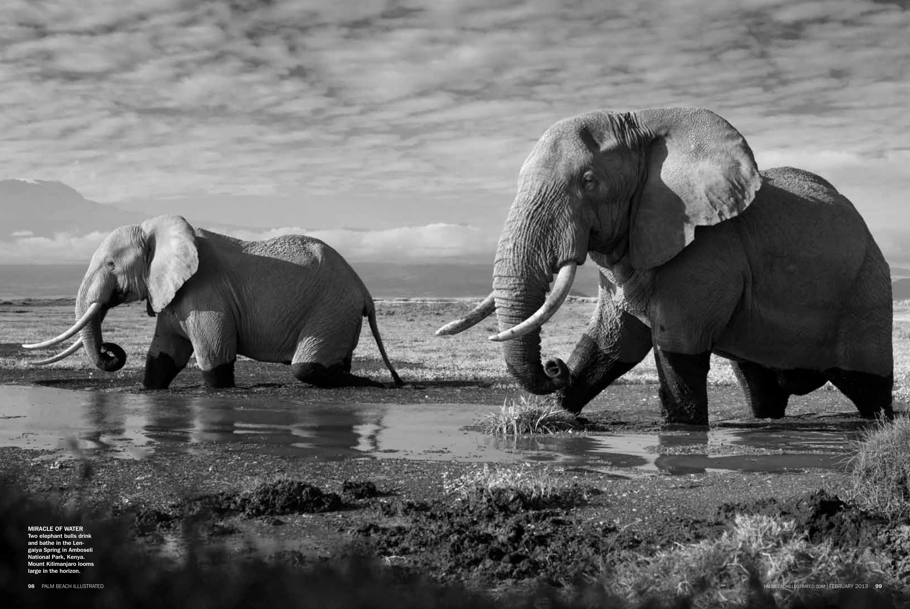
MIRACLE OF WATER Two elephant bulls drink and bathe in the Lengaiya Spring in Amboseli National Park, Kenya. Mount Kilimanjaro looms large in the horizon.