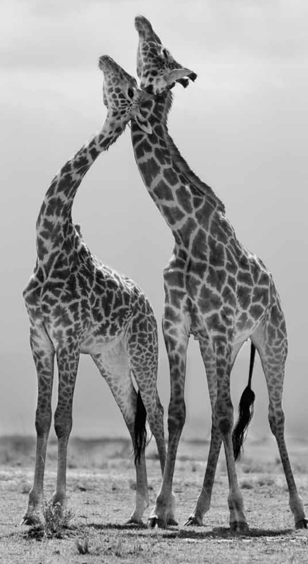
NECK-IN-NECK Male giraffes battle it out for turf dominance with a curious “neck wrestling” match. The winner proves his authority within the herd. Photographed along the Talek River, Maasai Mara National Reserve.

To capture the most elusive creatures, he sets up cameras with infrared triggers in forests like Aberdare National Park in Kenya. That’s how he photographed the rare mountain bongo, one of maybe 100 individuals in the wild and once thought to be extinct.