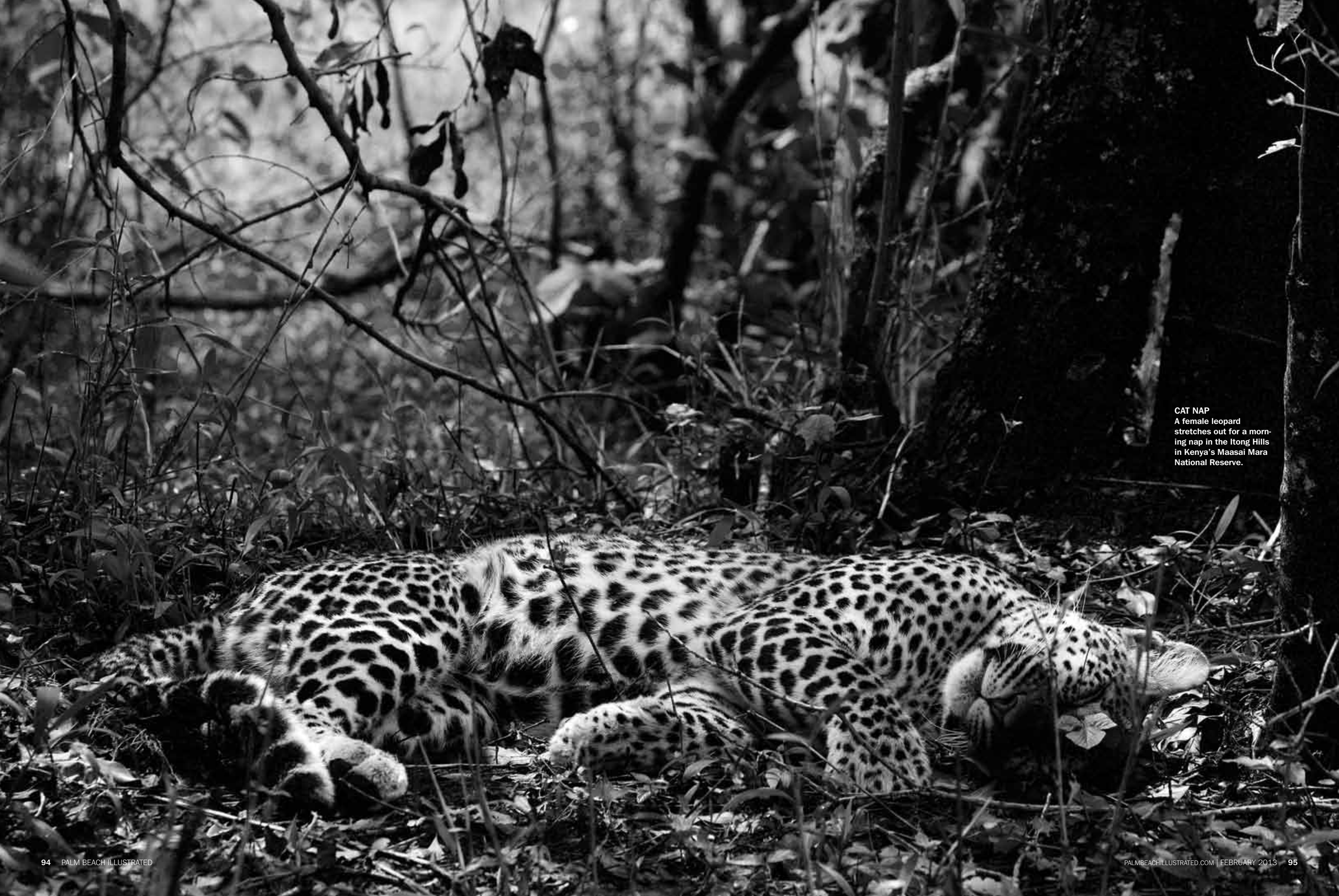
CAT NAP A female leopard stretches out for a morning nap in the Itong Hills in Kenya's Maasai Mara National Reserve.