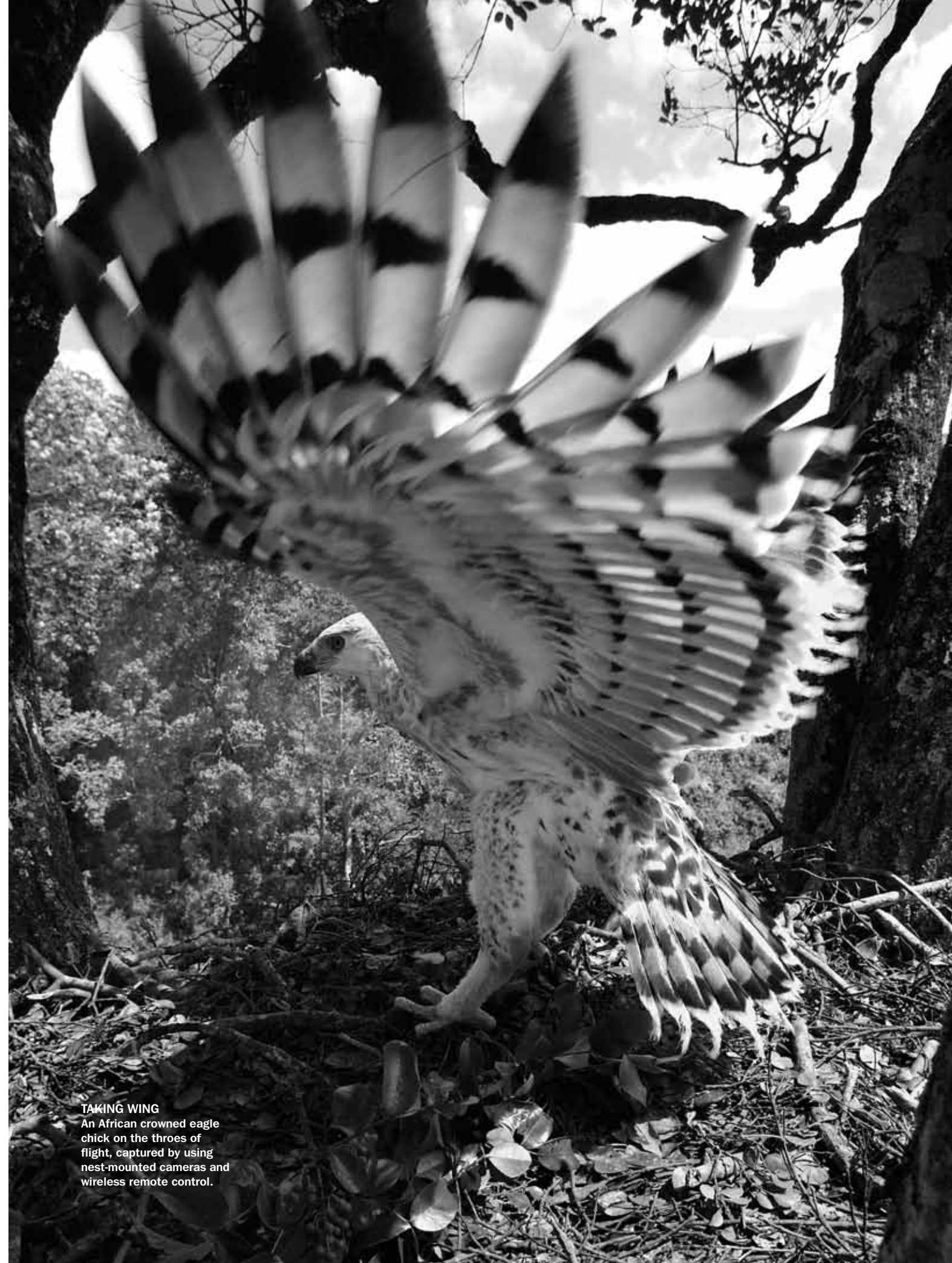
TAKING WING An African crowned eagle chick on the throes of flight, captured by using nest-mounted cameras and wireless remote control.